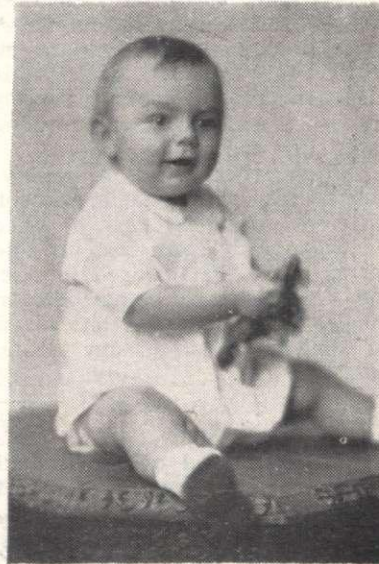
Do you know this boy?

This baby has grown up to be one of the best liked teachers here at PDSHS. He is sports-minded, and likes all popular sports. Although he enjoys drawing, he has little opportunity to do so, in his present occupation. He is a commuter who drives to Port Washington from Greenvale, his birthplace. Our Mystery Baby was graduated from the Roslyn Public Schools system, and then