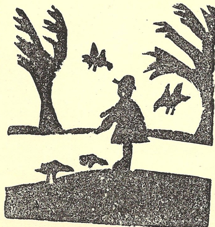
When March winds blow Winter must go!