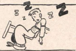
THE CHAP WHO SAT UP ALL NIGHT AND READ THE TEXT BOOK THROUGH TWICE