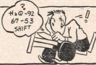
THE FOOTBALL PLAYER WHO TOOK CHEMISTRY