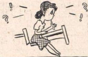
THE GIRL WHO ISN'T SURE WHETHER IT WAS GRANT OR LEE WHO CROSSED THE DELAWARE