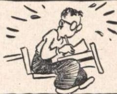
THE GRIND WHOSE ONE FEAR IS THAT HE WON'T HAVE TIME TO WRITE ALL HE KNOWS